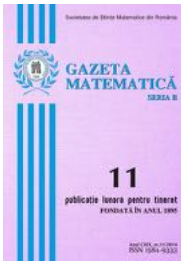
Cover of the first issue of Gazeta Matematică (1895, left) and a recent issue 11/2014 (right).

Amongst its many merits along the time, we mention: 1) the essential contribution for the establishment of an extraordinary mathematics competition atmosphere in Romania that led to the creation of the Romanian School of Mathematics; 2) creation of the IMO (International Mathematics Olympiad), nowadays the largest and most prestigious mathematics contest in the world for high school students (with 109 participating countries and 602 contestants in 2016, see https://www.imo-official.org/year_info.aspx?year=2016 ).