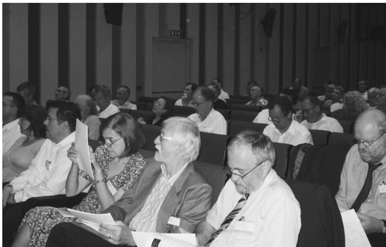
Delegates at Council.

The 2006 meeting of the European Mathematical Society's Council was held in the Conference Hall of the Centro Congressi dell'Unione Industriali in Torino. It consisted of two sessions, an afternoon session from 1pm till 6pm on 1st July and a morning session on 2nd July from 9am till 12am.